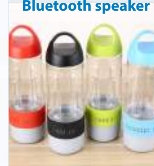
Water bottle with Bluetooth speaker