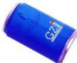
CAN Shaped Wireless Mouse